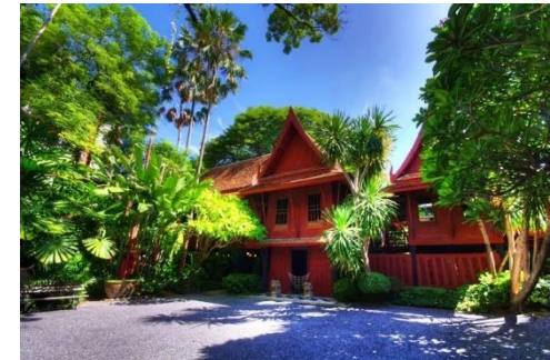
Jim Thompson House 1.3 km | 20 minutes