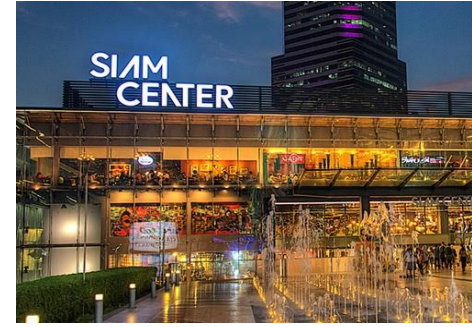
Siam Center 350 m | 5 minutes