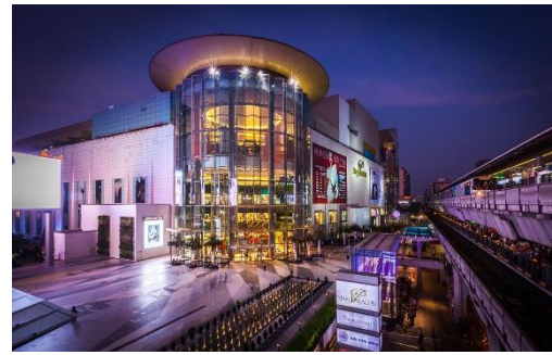
Siam Paragon 300 m | 4 minutes