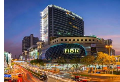
MBK Shopping Center 650 m | 10 minutes