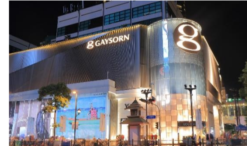
Gaysorn Village 850 m | 13 minutes