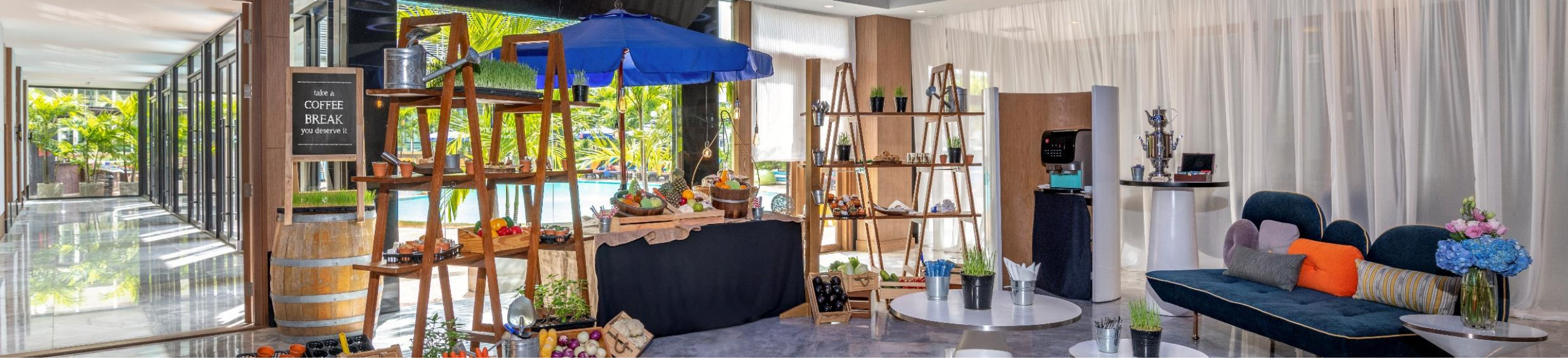
The Elements 4 th floor