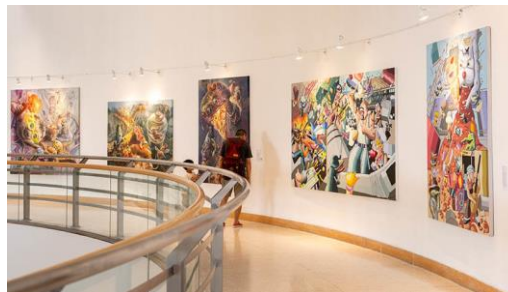
Bangkok Art & Culture Center 850 m | 13 minutes