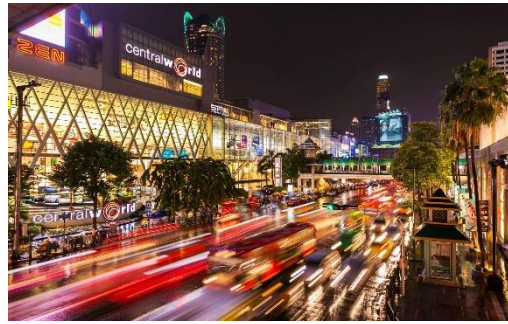
CentralwOrld 500 m | 7 minutes