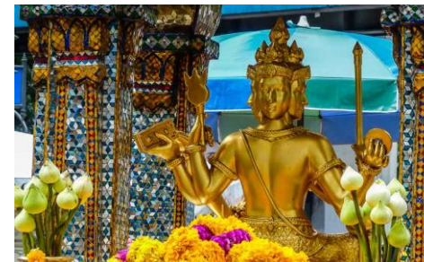
Erawan Shrine 750 m | 11 minutes