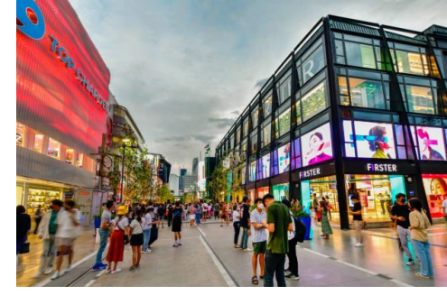
Siam Walking Street 150 m | 2 minutes